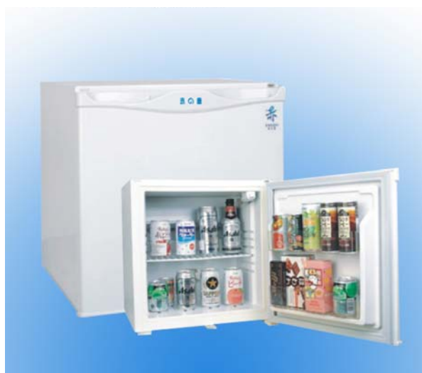
XC-32A with Door Lock