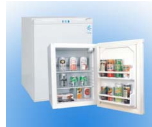
Model No. XC-32B