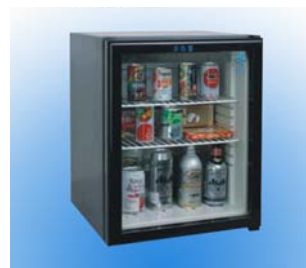
Model No. XC-42